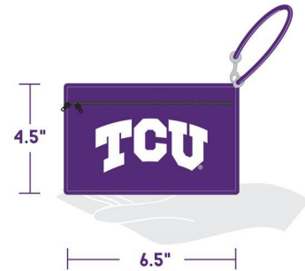
SMALL CLUTCH PURSE: NO LARGER THAN 4.5" X 6.5" WITH OR WITHOUT A HANDLE OR STRAP