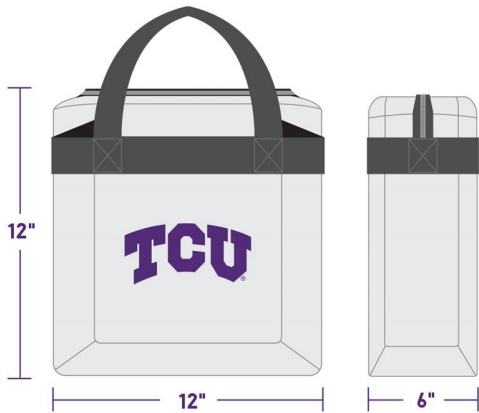
CLEAR TOTE: PLASTIC, VINYL OR PVC AND MAY NOT EXCEED 12" X 6" X 12"

EFFECTIVE AT ALL TCU SPORTING EVENTS TO ENHANCE PUBLIC SAFETY AND IMPROVE STADIUM ACCESS FOR ALL FANS.